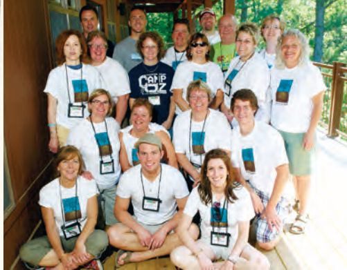
2010 CAMP OZ STAFF